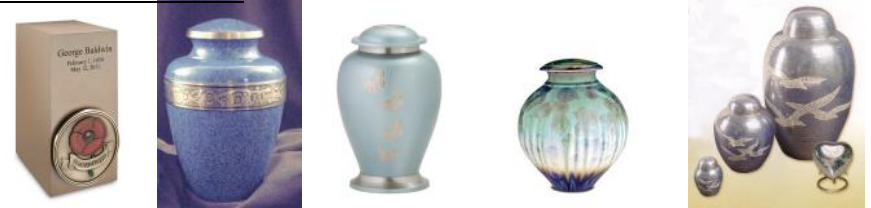
Sand Sheet Bronze Avalon Avondale Teal Viridian Sky In Flight