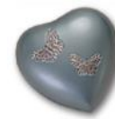
Avondale Teal Butterfly Heart