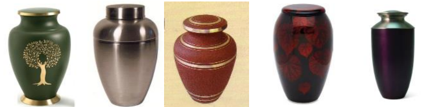
Tree of Life Stainless Steel Cabernet Brass Falling Leaves Monterey