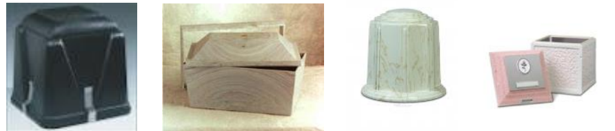
Vantage Hepburn Urn Vault Wilbert Regal Cameo Rose